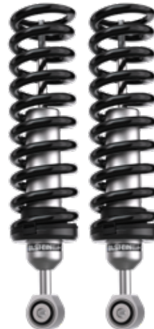
B8 6112 KIT