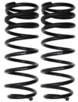
B12 (SPECIAL) COIL SPRING KIT