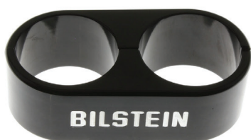
Billet Piggyback Mounting Clamp 11-176015