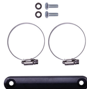
Frame Mount Clamp B4-KT2-Z009A00